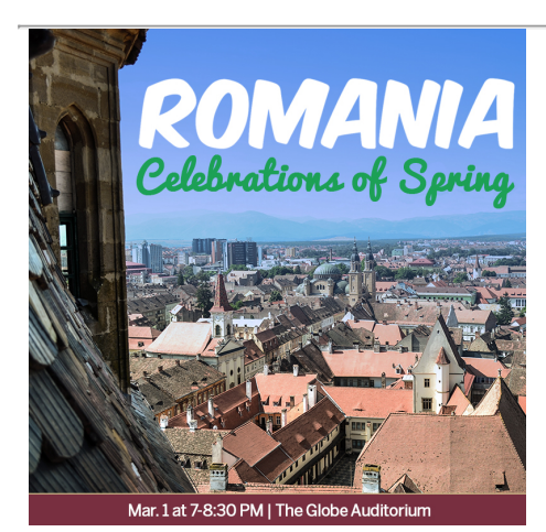
Romania (An Intercultural Program Series Event)*

Thursday, March 1 7-8:30 p.m. I The Globe Auditorium